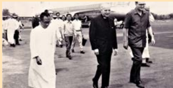
Fr Pedro Arrupe SJ arrives in Indonesia. Fr Arrupe established the Indonesian Jesuit Province on 8 September 1971.

The 11th World Union of Jesuit Alumni (WUJA) Congress will take place in Yogyakarta — a city where culture, spirituality, and education converge. Known as the cultural heart of Indonesia, Yogyakarta offers a rich setting for global Jesuit alumni to gather in the spirit of reflection, service, and leadership.